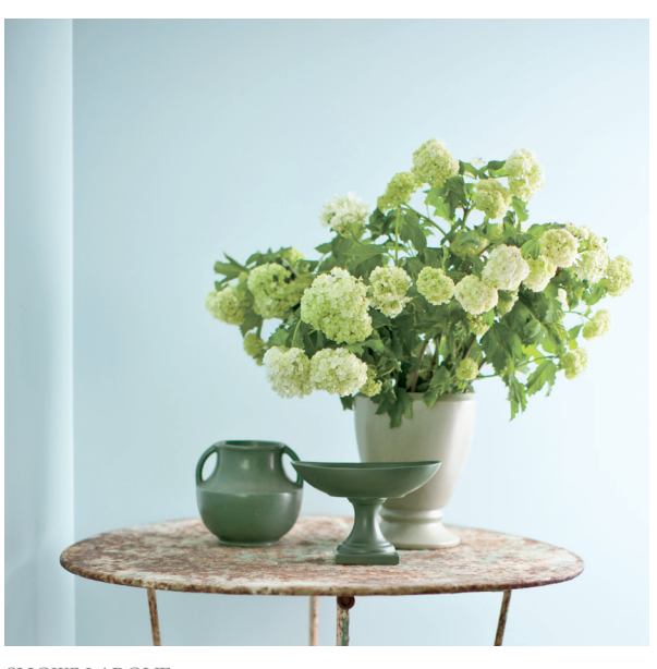
SHOWN ABOVE WALLS: Breath of Fresh Air 806, Aura, Matte

Much like a turbo-charger revs up the performance of a car, Color Lock technology improves the performance, durability, look, and feel of this incredible product. Color pigments are microscopically bonded to the dry paint film, permanently locking in the color. Special polymers wrap themselves around color particles, creating a thicker paint that dries harder and is less sensitive to high humidity and moisture for a new standard in durability, as well as improved flow and leveling.