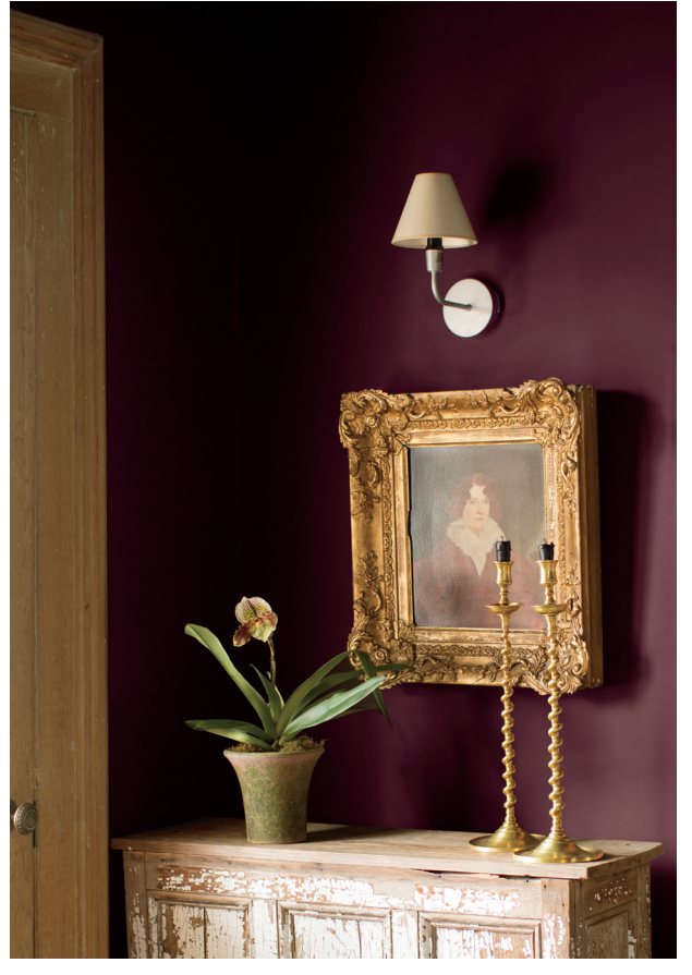
SHOWN ABOVE WALLS: New London Burgundy HC-61, Aura, Eggshell

Aura is formulated to dry faster than typical acrylic paint and can be re-coated in just one hour.